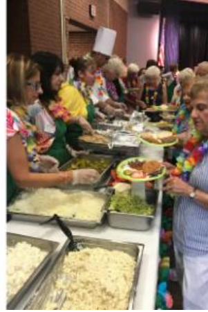
We have been busy attending health fairs across the state! Hamden Senior Center BBQ was a hit!