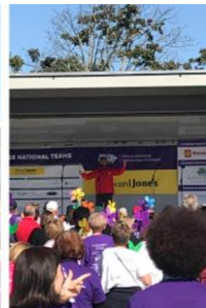
Gloria Gaynor was AMAZING! We participated in the Alzheimer's New Haven Walk & was the Water Sponsor this year at Lighthouse Point Park!