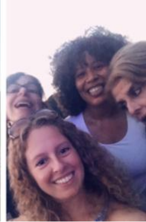
Sponsoring the Hamden Concert Series turned into great team building for us!